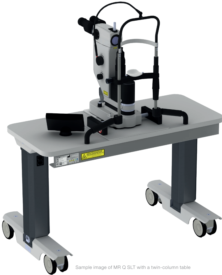
Sample image of MR Q SLT with a twin-column table