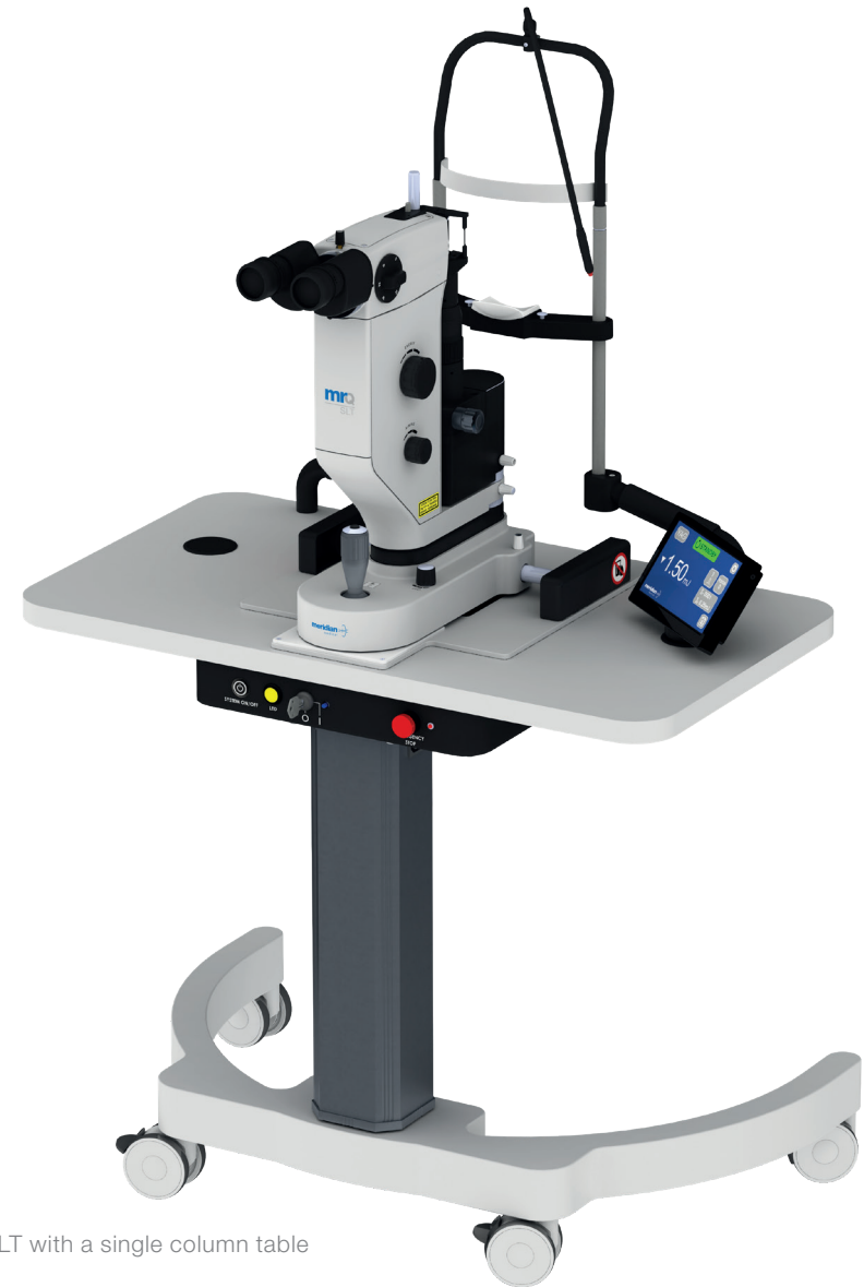
Sample Image of MR Q SLT with a single column table

Meridian Medical carefully selects the best European components and technology to assemble its lasers. We offer our users a robust and reliable unit. The MR Q SLT housing is made of a high-grade aluminium monobloc that gives unique solid feeling and dust-free electronics.