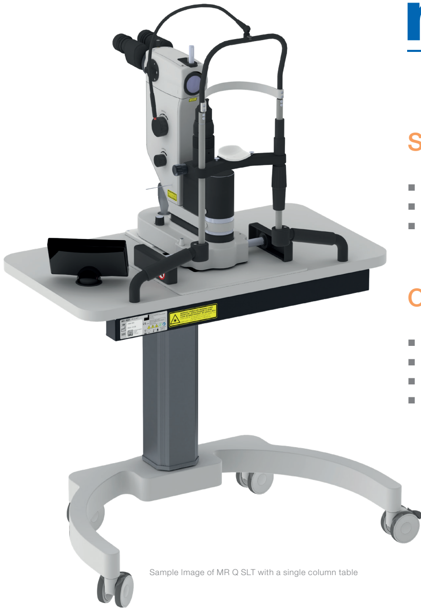
Sample Image of MR Q SLT with a single column table