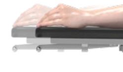
Armrest pair with linear guide and one-hand release, factory-fitted