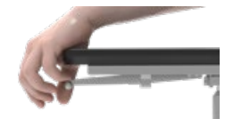
Armrest pair with one-hand release, factory-fitted