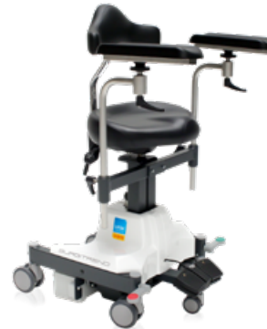
surgiTrend Comfort seat Item No.: 2200 0012