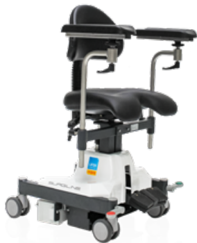
surgiLine Formed seat Item No.: 2200 0008