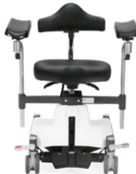
surgiLine Comfort seat Item No.: 2200 0013