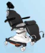
500 XLE comfort