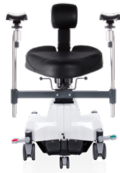
surgiTrend Dynamic seat Item No.: 2200 0010